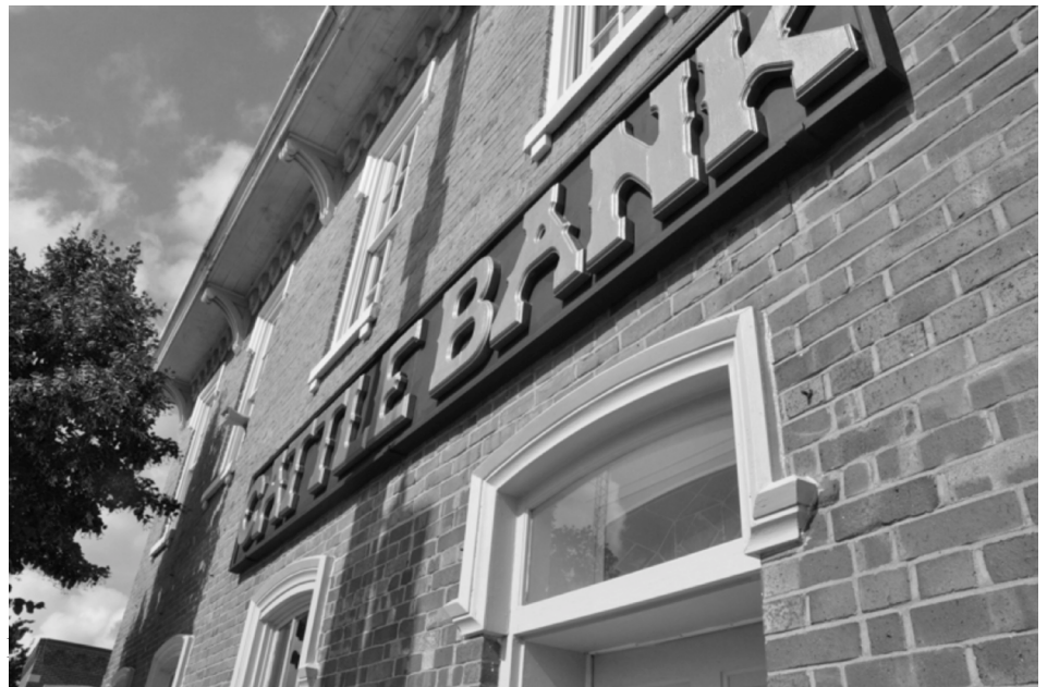
Champaign County Historical Museum

Committees have been formed and charged with planning for the care and exhibition of the collection, public relations, memberships, and fundraising. Four new galleries are envisioned on the ground level. The current general store, that many are familiar with, will remain and be enhanced with additional history of the Cattle Bank building as well as a smaller gift shop emphasizing our bookshop. The old gift shop room will become a gallery on the history of Champaign County, its towns, and the people who built them. The remaining two galleries will house rotating exhibits. The first exhibits will take advantage of the museum's vast quilt collection while the other will talk of County men and women in the