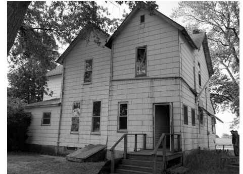
House in Sidell

June 2015: Seven houses in the Bristol Park area of Champaign, and a farm-