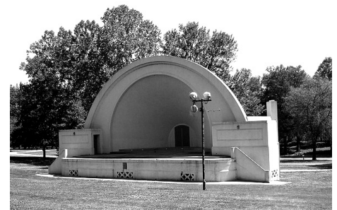
Riverside Park Band Shell