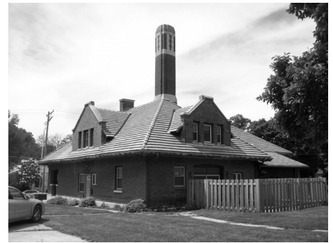
Carriage House as seen today

In 1927, Senator William B. McKinley bequeathed $200,000 to purchase a building for a YMCA in Champaign-Urbana. However, the onset of the Great Depression delayed the project until 1937, when $35,000 of the funds were used to purchase the Phillippe